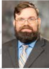
Randall Dickey School of Missions, Estonia