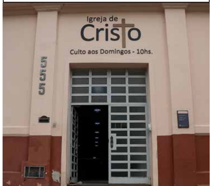
The church in Belo Horizonte, Brazil, is another part of the Brazilian Legacy.

YES , I/we will help. Enclosed is my one-time gift in the amount of $ _____.