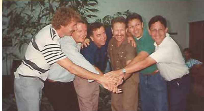
Teammates from the 1980 team from Sunset prepare for Recife, Brazil.