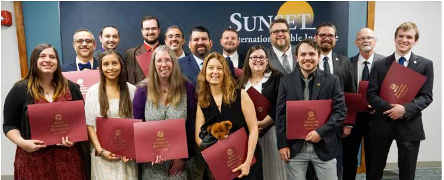
Many of the 2022 SIBI graduates excited to receive their diplomas

Most of the graduates have moved away from Lubbock and are either settling in at their first job at churches around the world or preparing for a mission. Please continue to lift up the graduates and their families in prayer as they serve the body of Christ.