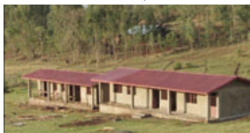
Nekempt Preacher Training School in the Western Territory of Ethiopia mainly trains Sudanese refugees