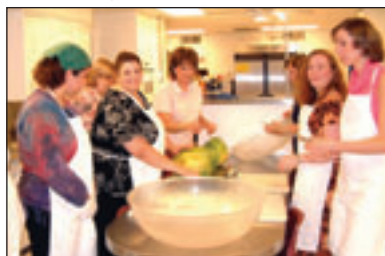
Getting ready to "feed the masses" at the Combination Workshop

WE BELIEVE THAT trained, knowledgeable women are very important to the growth and life of the church. Three programs of study are available for women at Sunset. Women who work or have small children