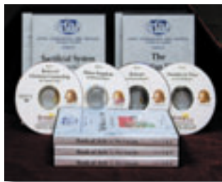
Forty courses are available on VHS tape and DVD as well as a large selection of books, audio cassettes and study guides

An integral part of the External Studies ministry are the 300 plus Satellite Schools that have been implemented around the world. This number continues to grow steadily. A Satellite School uses the 40 plus video curriculum to teach people the message of the Bible. For 30 years, External Studies has used the proven method of "distance learning" to teach and reach people hungry for the word of God. Satellite Schools are designed to equip a community