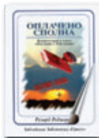
Paid in Full in Russian