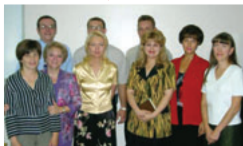
Ukrainian Bible Institute faculty & staff