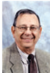
Bob Anderson Deaf Ministry