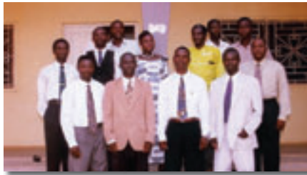
Second year students in Ghana