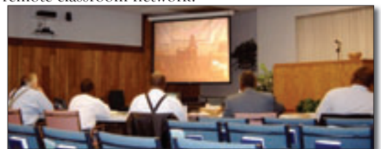
Fall River, Massachusetts

IN 2002, SUNSET ADDED a new feature to our ministry: Interactive Video Tele-conferencing. The first site has been located in Fall River, MA. The students in Fall River are able to interact with the instructor in Lubbock by a teleconferencing hookup. In the fall of 2004 we equipped a second classroom for our remote classroom network. Fall River is starting a record group of students in Level One classes. There are already other locations asking to be connected to our remote classroom network.