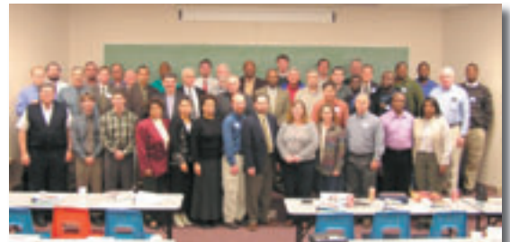
2004 Satellite School Administrators Training Workshop

of Bible students for personal growth and service to others. The impact of this ministry is significant because individuals and churches are being spiritually matured. A lifetime of service is to be accompanied by a lifelong dedication to learning. Because the task is so great and the consequences eternal, gaining Bible knowledge should never end.