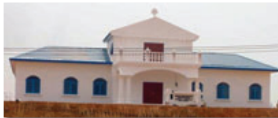
The recently completed Batam facility