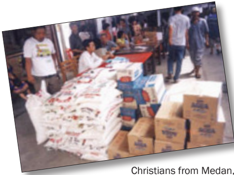
Christians from Medan, Indonesia distributing relief supplies and teaching materials in tsunami stricken Nias