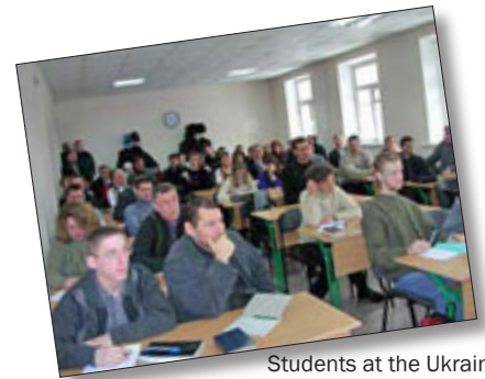
Students at the Ukraine Bible Institute in Donetsk

and spread the gospel throughout Mexico. Learn more about this work on the web at www.leon4christ.org .