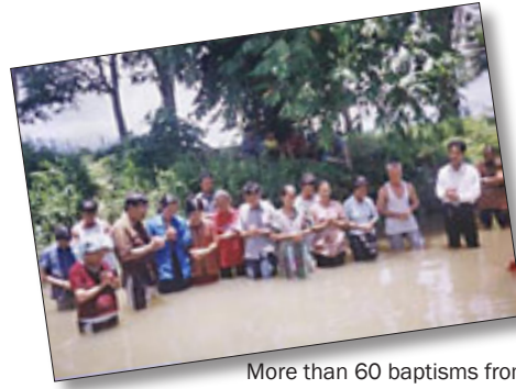
More than 60 baptisms from the work in Nias, Indonesia